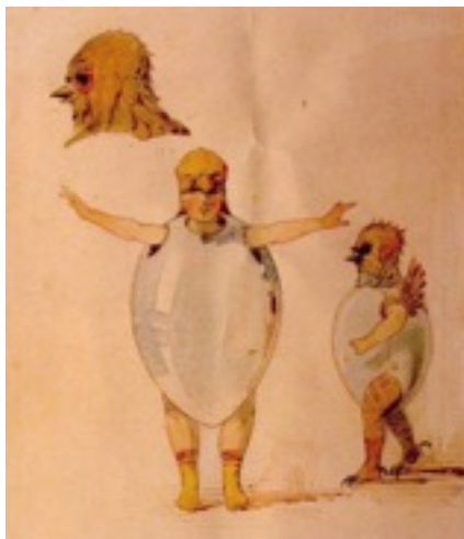
Sketches of theatre costumes for the ballet Trilby by Viktor Hartmann, inspiration behind No. 5 in Pictures at an Exhibition

In the following list, each movement is mentioned with its name, along with comments by Vladimir Stasov. Stasov was an influential critic who followed the careers of both Mussorgsky and Hartmann with interest. His programme notes on each movement give further insight into the imagery of Hartmann's artwork.