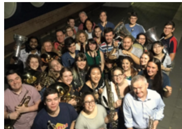
Players from the WA Wind Symphony

"The concert's namesake, Blue Shades, is a work celebrating the idioms and branches of jazz. It features a wild clarinet solo, sizzling brass, spectacular percussion, and is a great tribute to the jazz movement. Blue Shades definitely keeps the audience on its toes!"